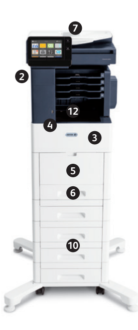
Xerox® VersaLink® C605 Color Multifunction Printer

Print. Copy. Scan. Fax. Email. Mobile connectivity.