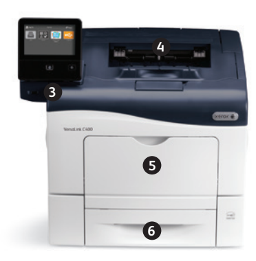
Xerox<sup>®</sup> VersaLink<sup>®</sup> C400 Color Printer Print.