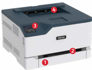
Xerox® C230 Color Printer