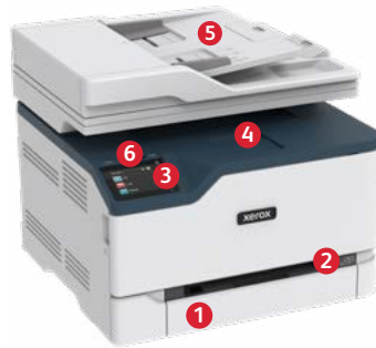
Xerox® C235 Color Multifunction Printer